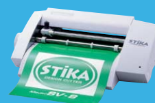
Model SV-8 160mm (8") Cutter