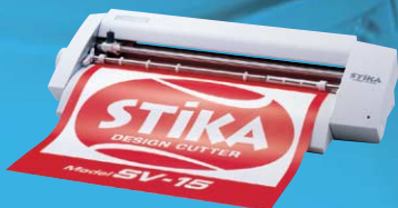
Model SV-15 340mm (15") Cutter

Create Colorful Custom Graphics with Ease