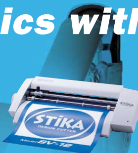
Model SV-12 250mm (12") Cutter